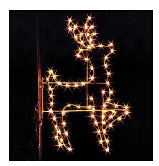
THE REIGNING DEER: York County's Fawn Grove was established when a lease for a tract of land was granted near the intersection of Baltimore and York roads, a known sporting ground for young deer, which were numerous at the time of the first settlement. Therefore, it's only fitting for the borough to use deer ornaments as its symbol of Christmas arriving each year.

The full price to replace the decorations was almost $15,000. The borough has been campaigning since July, seeking sponsorships and