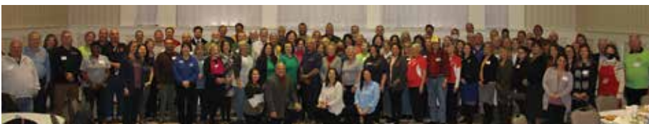
THANKFUL FOR COMMUNITY: The co-op recently hosted a meeting for representatives from more than 75 different organizations the cooperative supports through in-kind, monetary and advertising support. During the event, the co-op explained its more streamlined process for reviewing donation requests and introduced the committee of employees who help to vet each submission. Living up to its mission of “concern for community,” the cooperative invests funds each year in the service territory where we work and live.